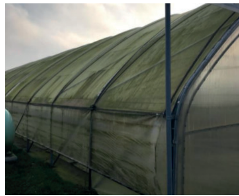
10% more light incidence on the production area can result in up to 10% more growth!

MENNO recommendation: FADEX® H<sup>+</sup> from 1%, mix 10 litres of product in 990 litres of water, apply 0.2 litres/m² to the surfaces either by spraying or as a foam. 1000 litres of this solution is sufficient for up to 5000 m². After 5 minutes, rinse off the dirt with clear water.